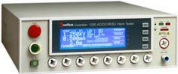
19050 Series Hipot Tester AC/DC/IR/SCAN