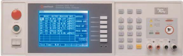
19032 Series Electrical Safety Analyzer

A more acceptable technique is to perform the non-destructive insulation resistance test before and after the Hipot test. Comparing the variations before and after provides more control of product performance over the long run.